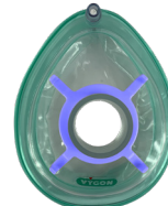
Mask (L) : 5557.65