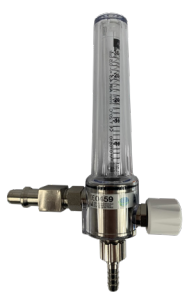
5563.42 : DIN O 2 .32 : DIN Air