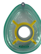
Mask Size 4 (S) : 5557.45