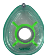
Mask (M) : 5557.55