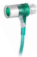
Boussignac CPAP : 5570.13