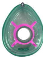
Mask Size 3 : 5557.35