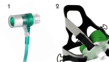
CPAP+ code V08776615 /06 /16* 1. Boussignac CPAP 2. NIV Facial Mask*

A set is a finished product that groups together different components to allow the complete or partial execution of a clinical procedure.