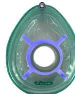
Mask Size 6 (L) : 5557.65