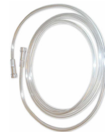
« Star-shaped » connecting tube : 5558.62