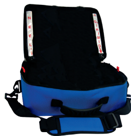
Standalone mini-case : 5562.799