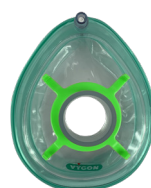
Mask Size 5 (M) : 5557.55