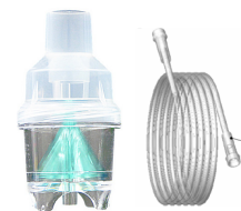
Nebuliser : VBBNB31193