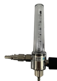
O 2 Flowmeter : 5563.xx :