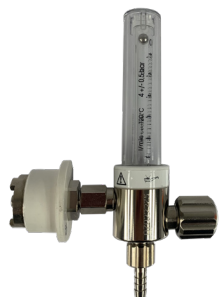
5563.02 : Afnor O 2 .01 : Afnor Air