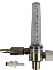
5563.41 : BSI O 2 .31 : BSI Air