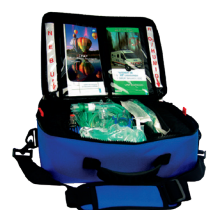
with Afnor flowmeter: 5562.802