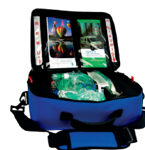
with DIN flowmeter: 5562.842