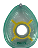
Mask (S) : 5557.45