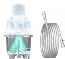
Nebulizer : VBBNB31193