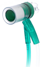
CPAP WEINMANN : 5570.132A