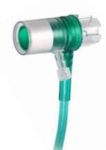
Boussignac CPAP : 5570.13