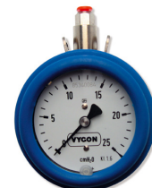
Manometer : 527.01