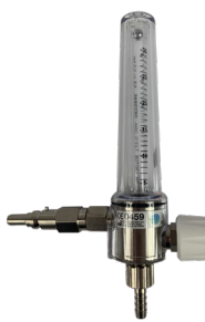
5563.44 : Nordic O 2 .34 : Nordic Air