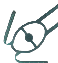
Silicone Harness : 5559.01