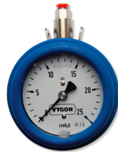
Manometer : 527.01