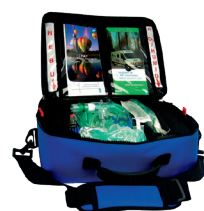
without flowmeter: 5562.700