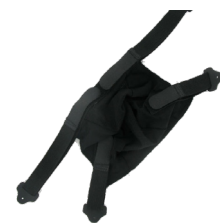
Fabric Harness : 5559.03