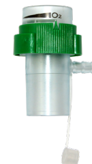
Straight FiO 2 Regulator : 5566.02